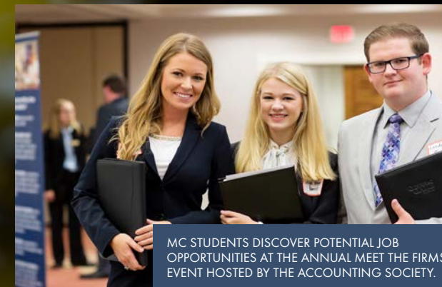
MC STUDENTS DISCOVER POTENTIAL JOB OPPORTUNITIES AT THE ANNUAL MEET THE FIRMS EVENT HOSTED BY THE ACCOUNTING SOCIETY.