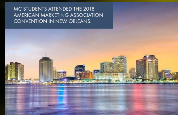
MC STUDENTS ATTENDED THE 2018 AMERICAN MARKETING ASSOCIATION CONVENTION IN NEW ORLEANS.