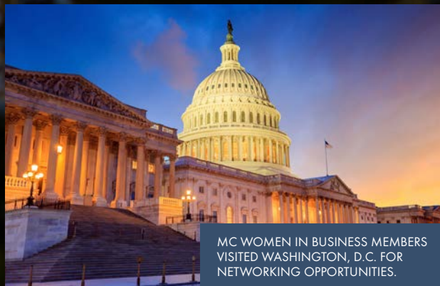
MC WOMEN IN BUSINESS MEMBERS VISITED WASHINGTON, D.C. FOR NETWORKING OPPORTUNITIES.