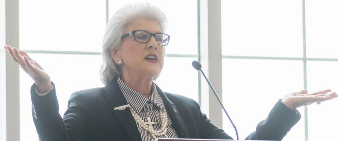
This page: Senator Robin Robinson